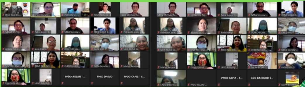
4th Quarter Regular online/virtual Meeting of the SOCIAL DEVELOPMENT COMMITTEE (SDC)

RESOLUTION SUPPORTING NNC ACTIVITIES FOR THE FORMULATION, APPROVAL, AND INTEGRATION OF LOCAL NUTRITION ACTION PLAN AS A STRATEGY OF LGU MOBILIZATION IN SUPPORT TO PPAN 2017-2022